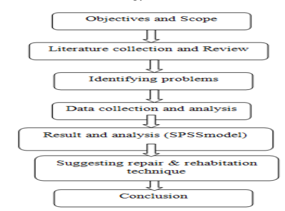
Figure 3.1: Representation OF The Methodology That Is To Be Carried Out In The Project Work.